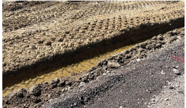
Before Weber found Invigorate Plus, the lot at Ohio Mulch Supply was considered unsuitable for any kind of paved surface.

Within two-and-a-half weeks, Weber invited his contractor's team back out to take another look at the lot. "They were surprised by the density and how quickly it set," Weber said. "It was unlike anything they'd seen." The team continued to test the surface by driving a fully loaded semi over it. When the surface showed no sinkage or cracking, they deemed it suitable for trucks and landscaping equipment to drive and park on.