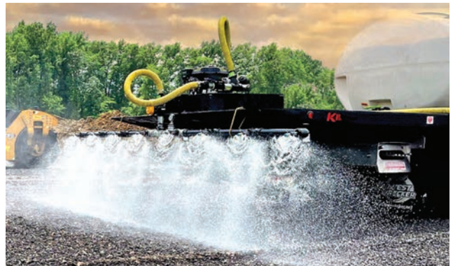
After Weber's crew cleared the topsoil, Invigorate Plus was sprayed onto six inches of loose millings.