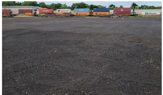
To form the new surface, the treated millings were compacted by an asphalt roller on the same day they were laid down.