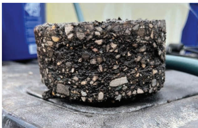
Core sample of the RAP millings that were treated with the Invigorate Plus re-binder.